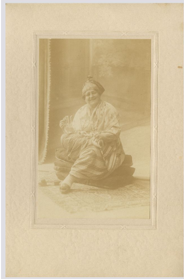
Studio portrait of a woman in character as 'Aunt Mariota' in the play 'Dorćolska posla'