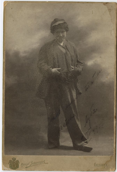
Studio portrait of Ljubica Pavlica