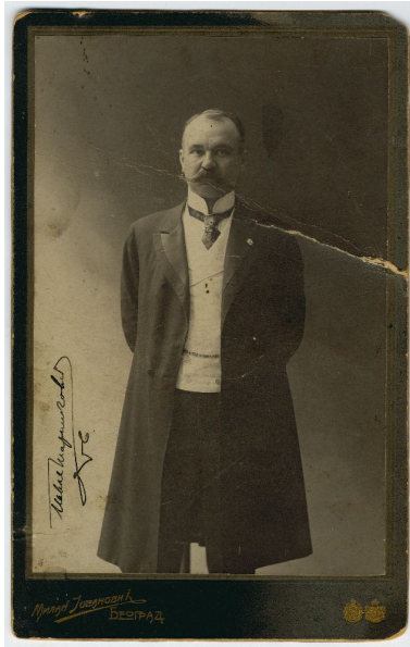
Studio portrait of Pavle Marinković