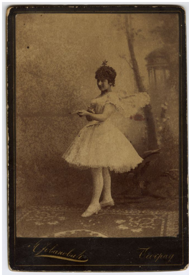
Studio portrait of a ballerina