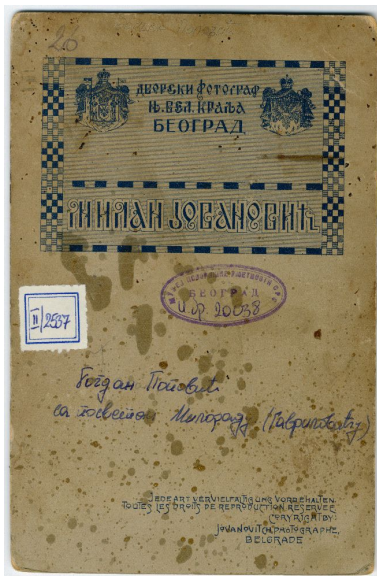
Studio portrait of Bogdan Popović