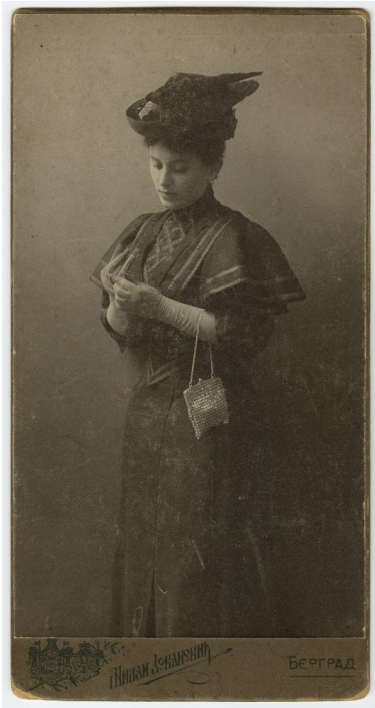
Studio portrait of actress Coca