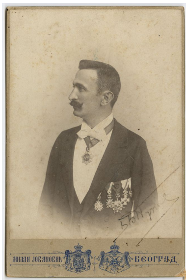
Studio portrait of Branislav Nušić