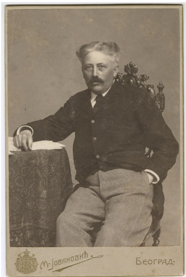
Studio portrait of writer Stevan Sremac