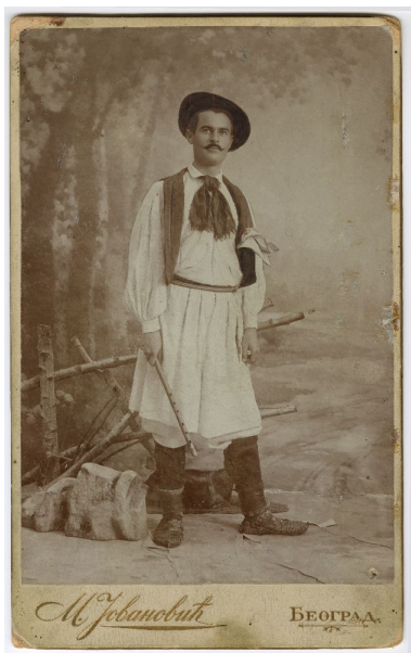
Studio portrait of Milorad Petrović