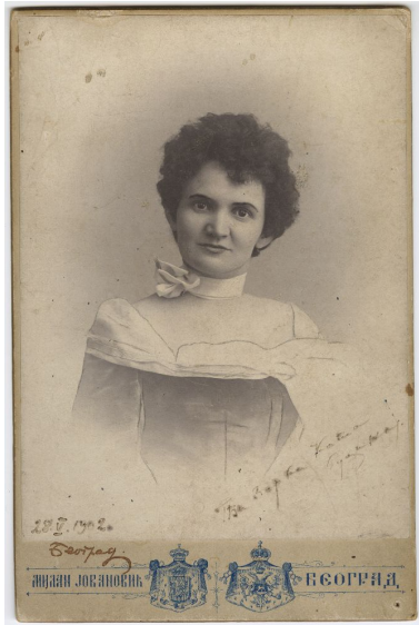
Studio portrait of Katarina-Katica Rucović