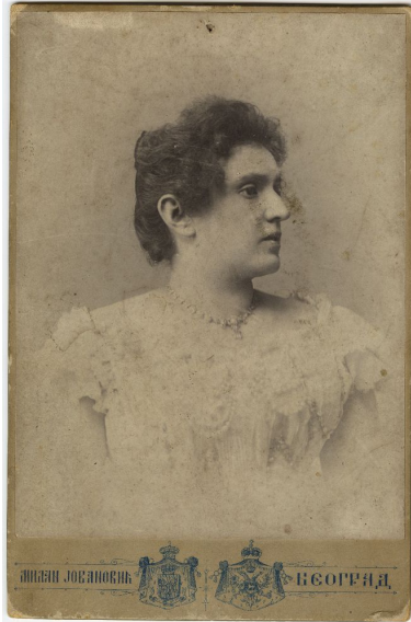
Studio portrait of Savka Miljković