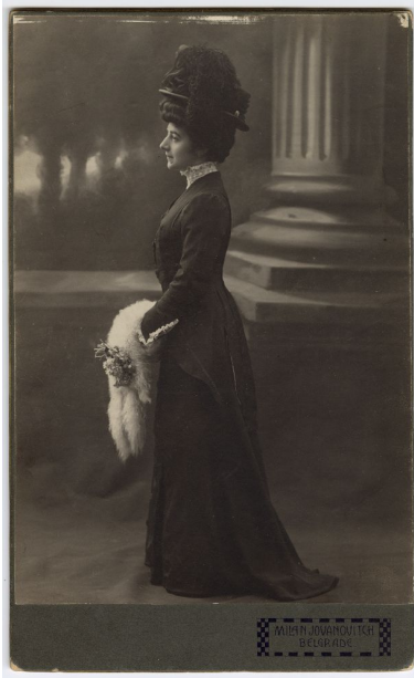
Studio portrait of actress Aleksandra Bojić