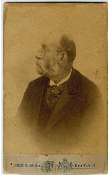
Studio portrait of Stojan Novaković