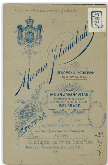
Studio portrait of Toša Anastasijević