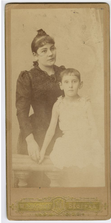
Studio portrait of actress Zorka Todosić with a child