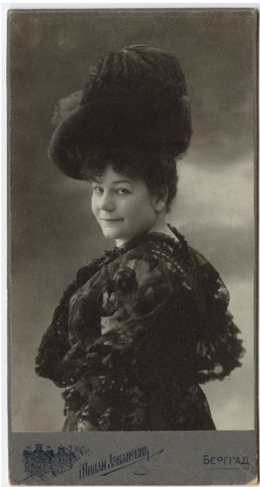
Studio portrait of actress Zorka Todosić