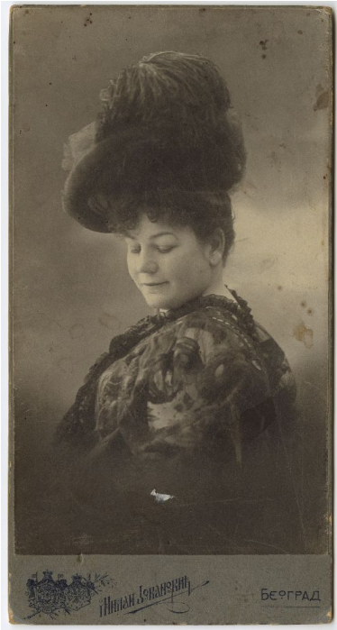
Studio portrait of actress Zorka Todosić