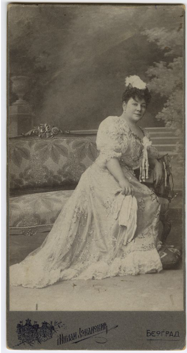
Studio portrait of actress Zorka Todosić