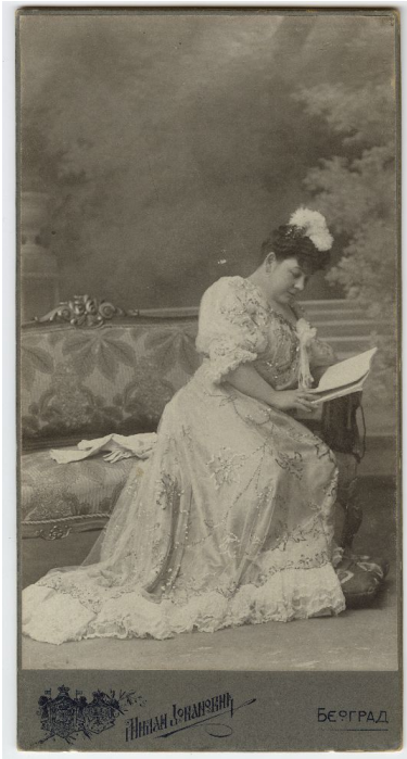
Studio portrait of actress Zorka Todosić