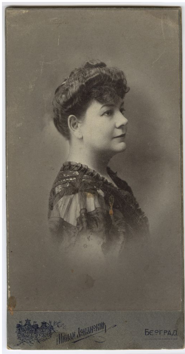
Studio portrait of actress Zorka Todosić