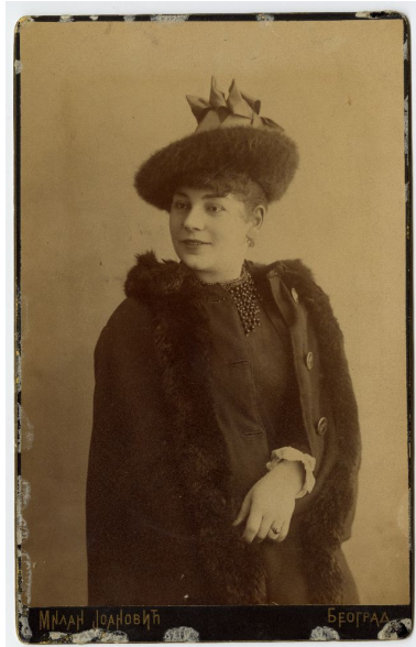
Studio portrait of actress Zorka Todosić