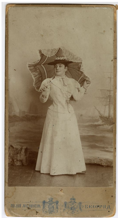
Studio portrait of actress Zorka Todosić