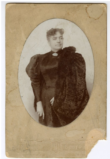
Studio photograph of a woman in a dark dress