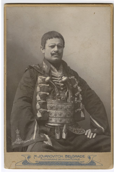
Studio portrait of actor Milorad Petrović in character as 'Hajduk Veljko'