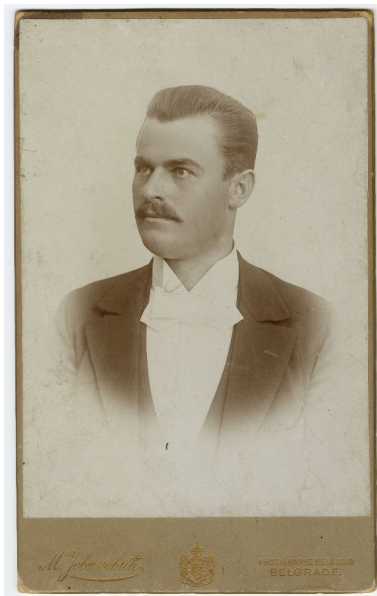
Studio portrait of actor Milorad Petrović