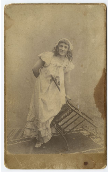
Studio portrait of actress Ljubica Pavlica