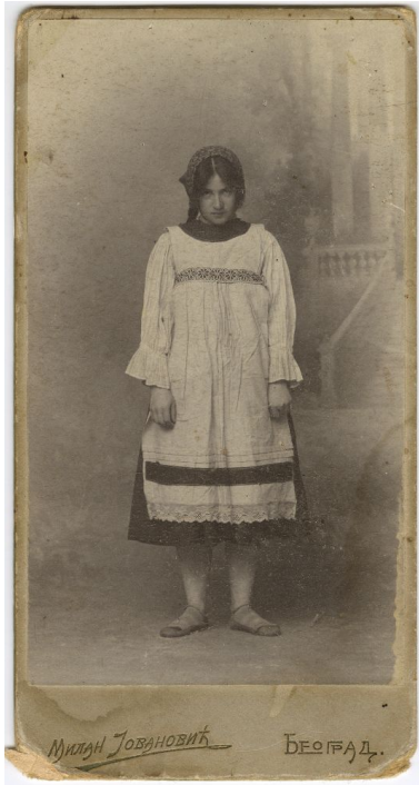
Studio portrait of actress Ljubica Pavlica in character as 'Anísya'