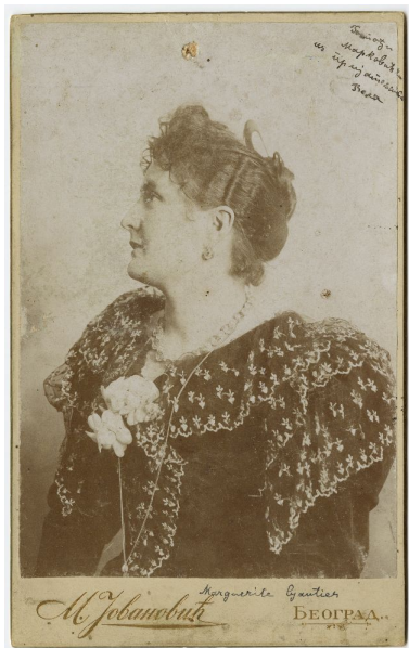
Studio portrait of Vela Nigrinova in character as 'Marguerite Gautier'