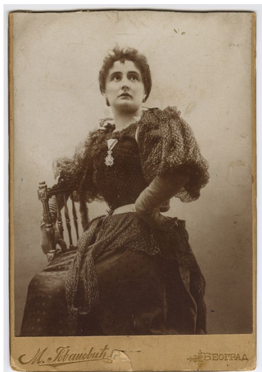
Studio portrait of Vela Nigrinova