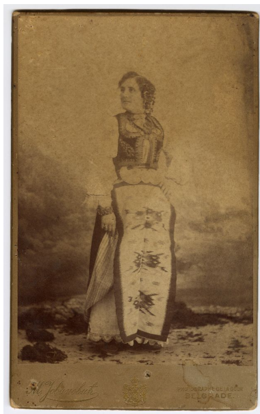
Studio portrait of actress Vela Nigrinova in character as 'Ljubica'