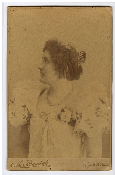
Studio portrait of Vela Nigrinova