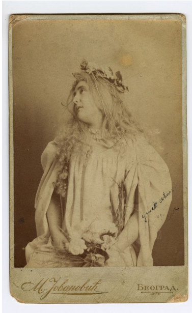
Studio portrait of Vela Nigrinova