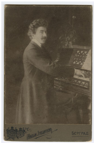
Studio portrait of composer Josif Marinković