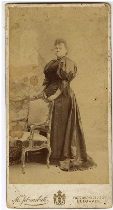
Studio portrait of Julka Stepićeva Jovanović