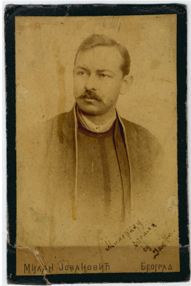
Studio portrait of writer Janko Veselinović