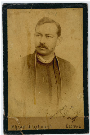
Studio portrait of writer Janko Veselinović