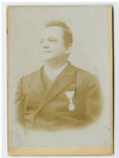
Studio portrait of a man