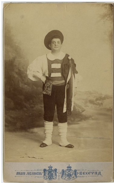
Studio portrait of Pera Dobrinović in character as 'Jovan' from the opera 'Jovančini svatovi'