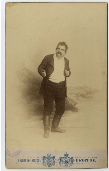
Studio portrait of Pera Dobrinović in character as 'Paja' from the play 'Pop Dobroslav'