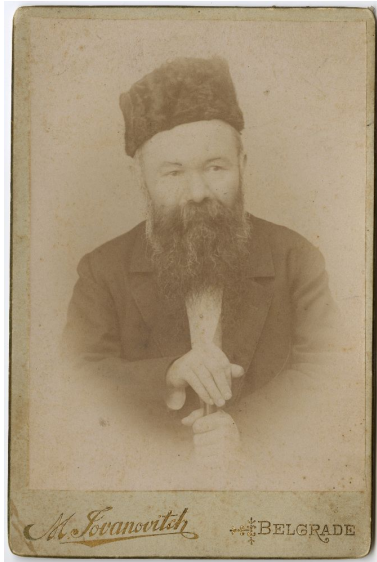
Studio portrait of writer Milovan Glišić