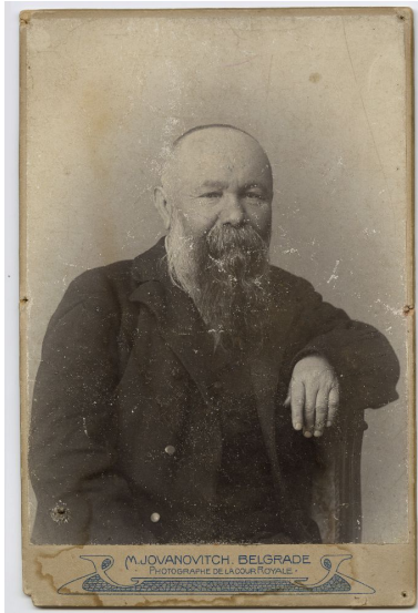
Studio portrait of writer Milovan Glišić