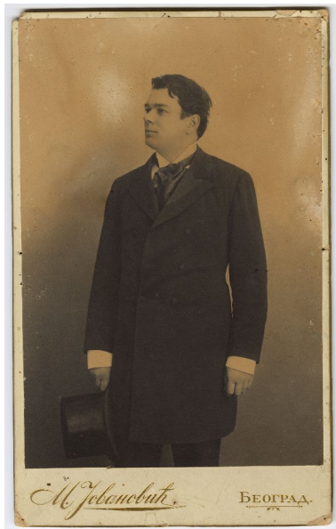
Studio portrait of Milorad Gavrilović