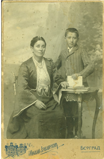
Studio portrait of a woman and a boy