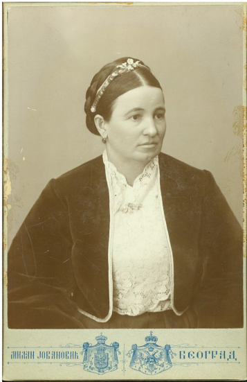
Studio portrait of Ms. Roksanda