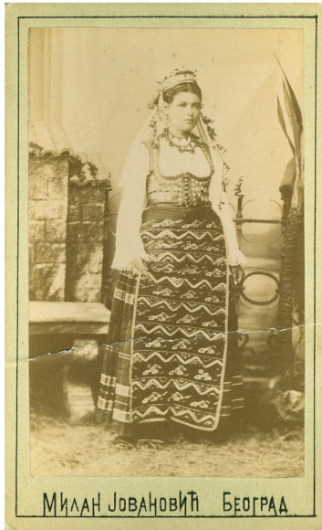
Studio portrait of a woman in folk dress from Požarevac