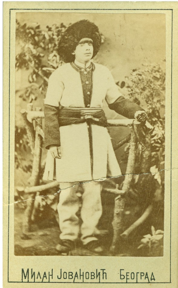
Studio portrait of a man in Vlach folk dress