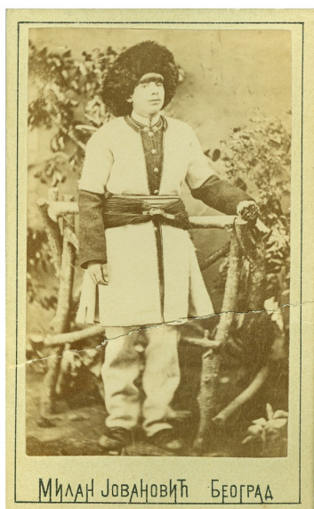
Studio portrait of a man in Vlach folk dress