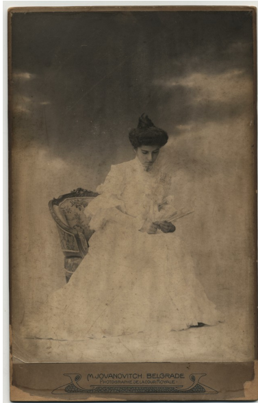
Studio portrait of Princess Jelena of Serbia