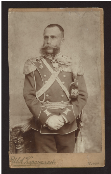
Studio portrait of Colonel Veliko Kardzhiev