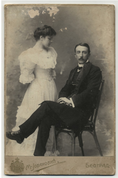
Studio portrait of a couple © Miloš Jurišić