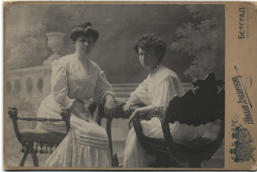
Studio portrait of two women © Miloš Jurišić