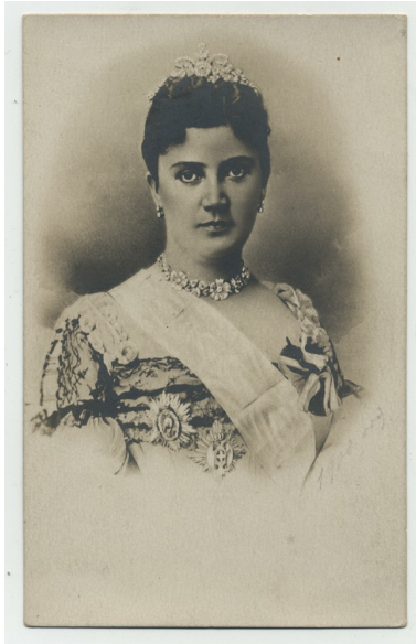
Studio portrait of Queen Draga Obrenović